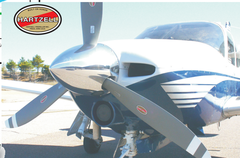
580 Super ® Commander 115

Finally, the great Commander wing has been married with the perfect engine to achieve record-breaking results!